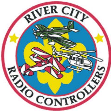
Current Logo Logo #1