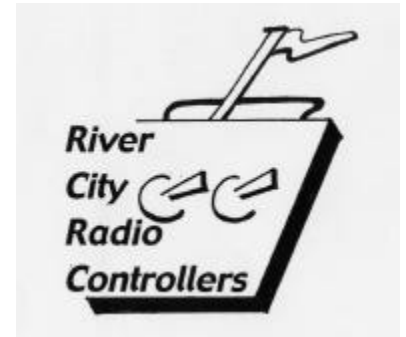
Logo Entry #3